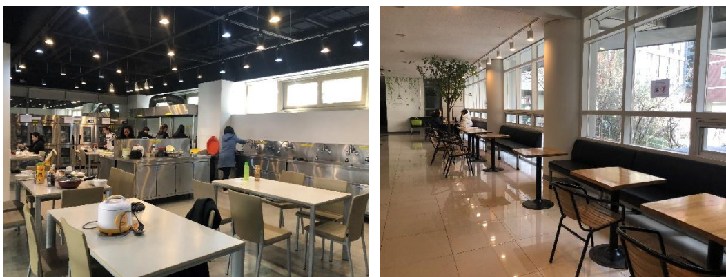
&lt;Community Kitchen &amp; Cafeteria&gt;

The Dormitory and International House provides coin-operated laundry rooms and a gym for its residents' use. These are located on the basement floor and open 24 hours. Seminar rooms, student lounges, and an internet café are also available for the residents. * Due to Covid-19, the operation hours can be changed or closed without notice.